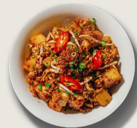
Traditional Black Carrot Cake 🥕 local inspired black carrot cake, superior light and dark soy sauce, free range egg vegetarian, contains allium, egg, soy, wheat +$1.00