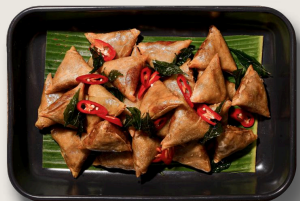
Indian Spiced Samosa 🌿🌶️ turnip, carrot, mixed spice vegan, spicy, contains allium, wheat