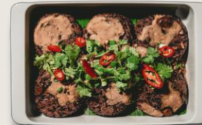
Purple Rice Loh Mai Kai purple rice, chicken, chestnut contains allium, shellfish, soy, wheat