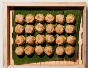
Handmade Chicken Siew Mai 🌶️ shrimp meat, turnip spicy, contains allium, shellfish, wheat +$1.00