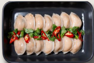
Steamed Mini Soon Kueh 🌿 turnip, carrot, mushroom vegan, contains wheat