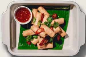
Vegetable Spring Roll 🌿👑 cabbage, tofu, wood ear mushroom vegan, contains soy, wheat