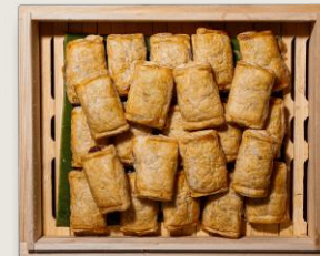
Flaky BBQ Chicken Puff 👑 flaky pastry, BBQ sauce, five spice powder contains allium, soy, wheat +$1.00